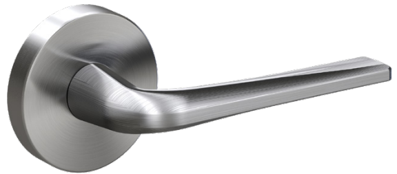
Sierra ● ABC ● MB ● BSC*