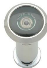
Door viewer ● MB ● SCP