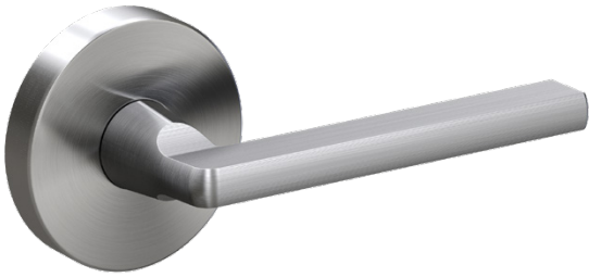
Alba ● BSC