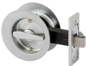
Cavity slider ● ABC ● MB ● SCP