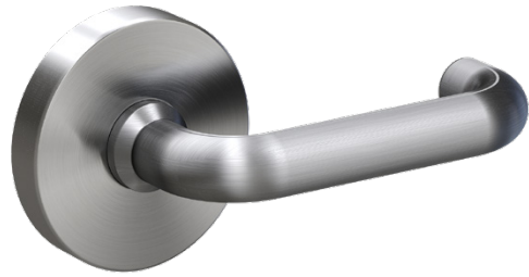
Centra ● BSC