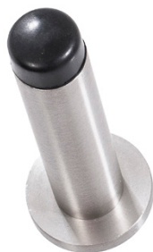
Wall mounted door stop* ● ABC ● MB ● SSS